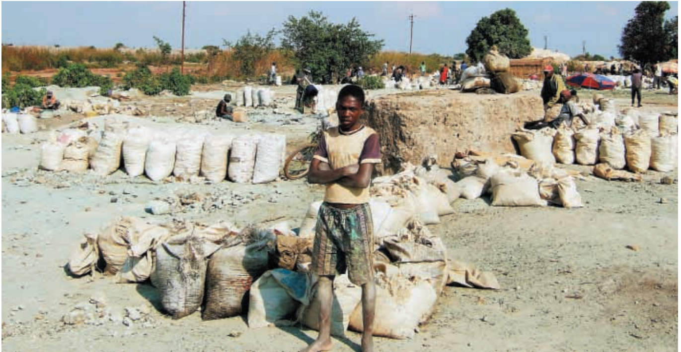
Young boy with sacks of minerals at Ruashi mine, Katanga, November 2005.