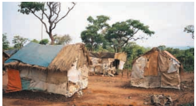
Miners' camp, near Kawama mine, Katanga, November 2005.

spair, even well-educated people have been forced to turn to artisanal mining in the absence of other sustainable sources of employment. Those working as miners at the end of 2005 included qualified lawyers, doctors and engineers – all working in harsh conditions and sometimes earning no more than around US $3 a day. A typical example was a young man interviewed by Global Witness, who worked both as a miner and a négociant ; he had completed the first year of a law degree but had been working as a miner for more than five years. He had initially interrupted his degree in order to earn money to support his pregnant fiancée, but he had never had the opportunity to resume his studies. He now had three children to support and was effectively trapped by his family commitments. 4 Former Gécamines workers, many of whom were professionally trained and highly skilled, have also turned to artisanal mining following the mass redundancies.