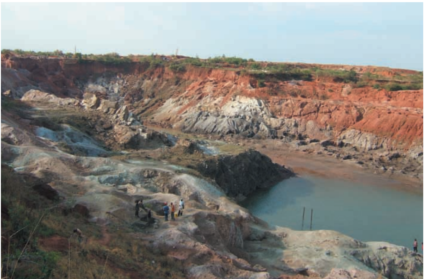
Ruashi mine, Katanga, November 2005.

As the industrial sector continues to grow in Katanga, so artisanal miners will continue to be edged out by multinational companies. The government has been encouraging the expansion of industrial mining without making any specific provision for the tens of thousands of artisanal miners and their dependents, for whom alternative sources of livelihood remain extremely limited. The economic consequences for these families could be serious. Some industrial mining companies have been willing to employ some of the artisanal miners they found on their concessions, and others may be willing to do so in the future; but the proportion of those who can be employed by these companies will always be small compared to the huge number currently mining artisanally.