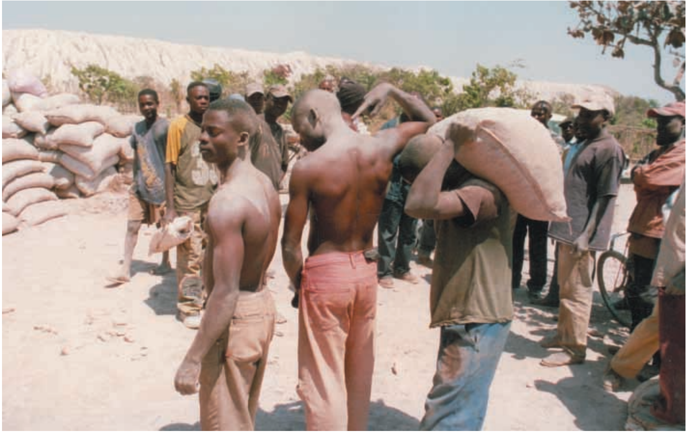
Artisanal miners carrying bags of minerals, Mutoshi mine, Katanga, November 2005.

shafts. 105 This was just a sample, not an exhaustive count; the total number is likely to be considerably higher. Figures for 2004 were almost certainly higher because of a major accident in Shinkolobwe mine on 8 July 2004, in which dozens may have died. ix A miner who had worked in Shinkolobwe for about nine months, in 2003, recalled that there were frequent accidents there; he estimated that a mineshaft would collapse on average twice a month, even before the major accident in 2004. 106