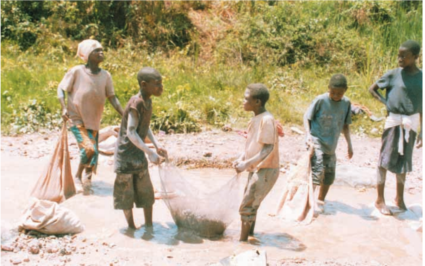
Young boys sifting minerals, Kolwezi, Katanga, 2005.

children were afraid that if they complained about the weight of the bags, or refused to carry the bags, they would be accused of being weak and would not be allowed to work anymore. Neither the police nor the Policar did anything to stop this practice. Children worked in teams of 15 or 20; each child would receive 800 francs for loading a 20 tonne vehicle, or 1,000 francs for loading a 40 tonne vehicle. 137