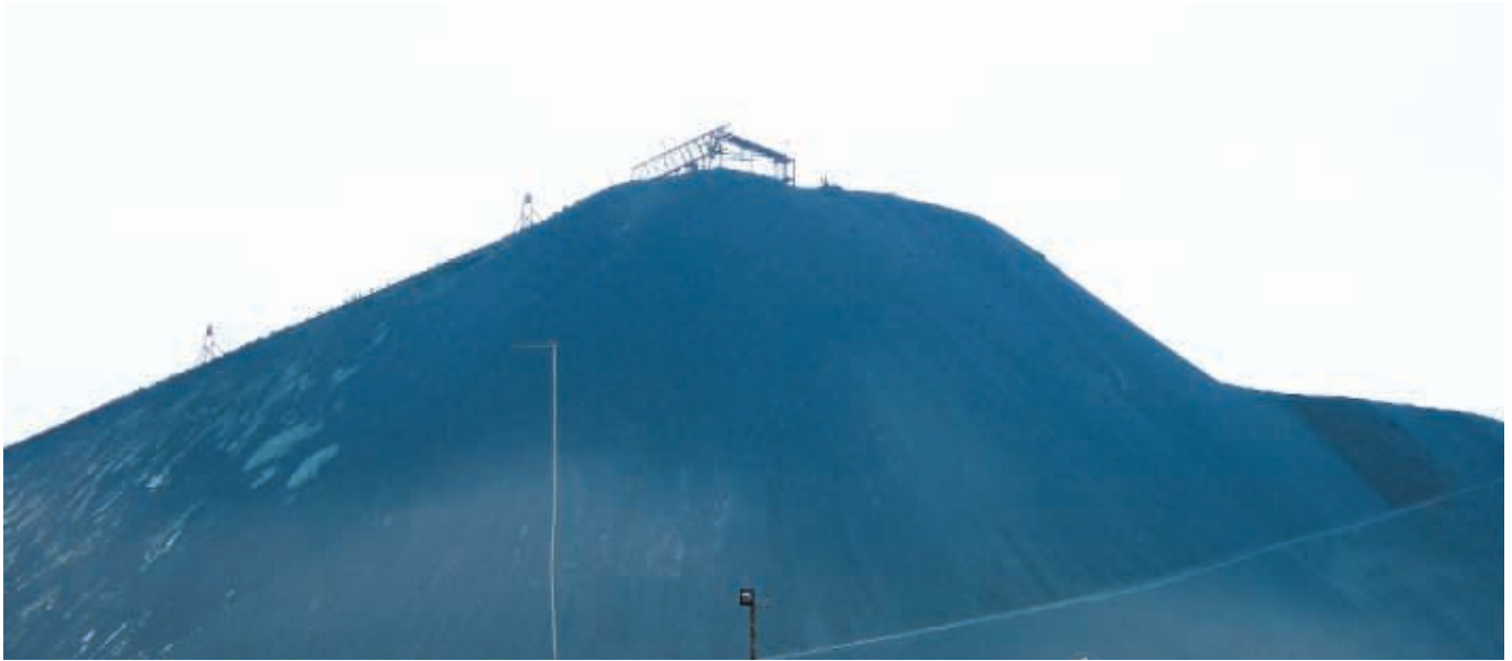
'Big Hill', copper and cobalt slag heap, Lubumbashi, November 2005.

The Congo is so rich in mineral wealth, you can't just ignore it. You don't want to be the last guy at this party. 141