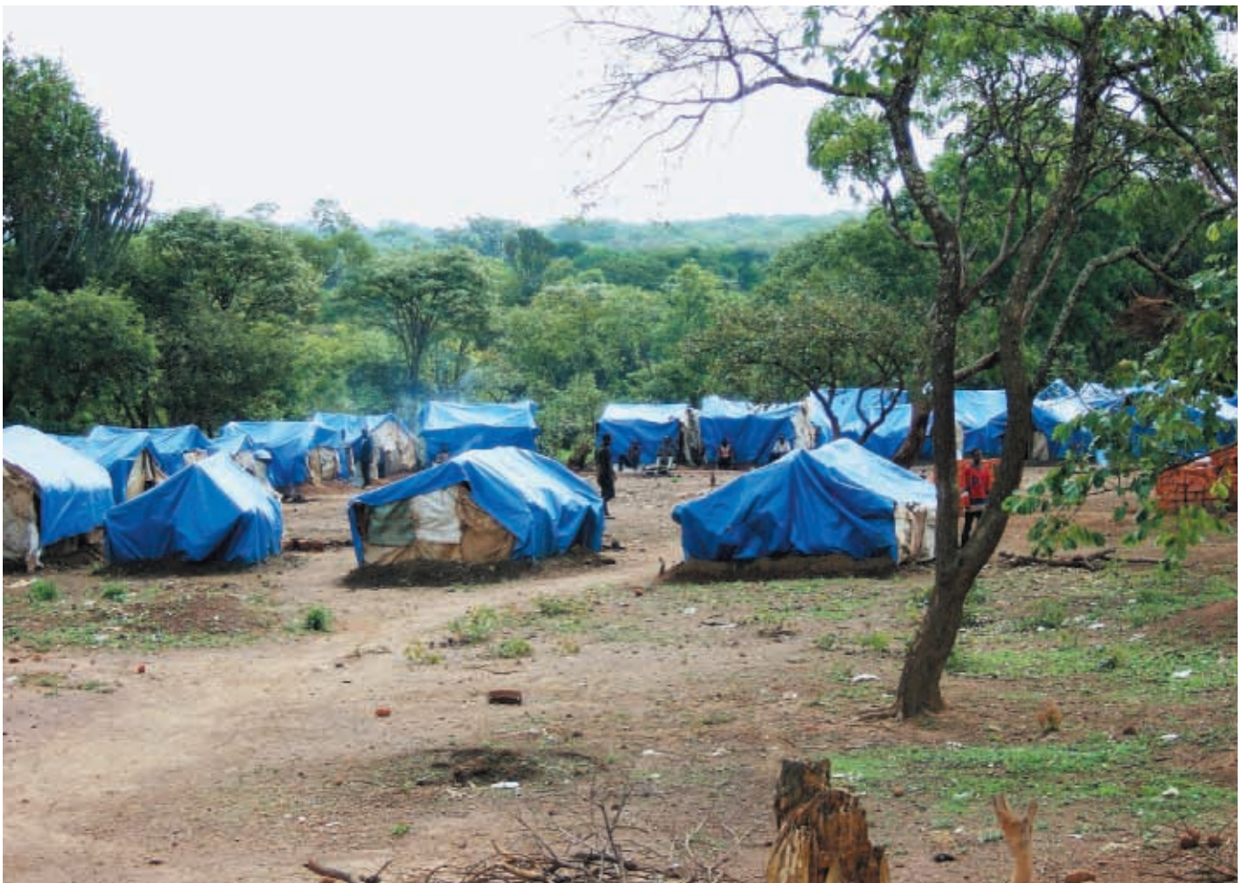
Miners' camp, near Kawama mine, Katanga, November 2005.

Global Witness researchers visited a camp near the Kawama copper and cobalt mine, outside Kolwezi. Artisanal miners working in Kawama, as well as few local farmers, lived in the camp. CMKK ran a section of Kawama mine, and the miners there were all working for CMKK. The local CMKK representative told Global Witness that CMKK membership cost 1,000 francs for miners and 2,500 francs for négociants; these were one-off rather than annual payments. 94 The arrangement was that the miners would sell the products they mined to CMKK and CMKK would look after and promote their general interests. The miners whom Global Witness spoke to in Kawama at the end of November 2005 had been working for CMKK for up to one month, but none