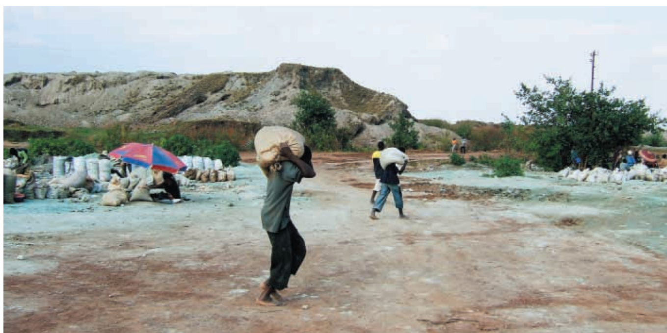
Young men carrying sacks of minerals, Ruashi mine, Katanga, November 2005.

Companies operating and investing in Katanga also have a responsibility to ensure that their presence in the region is not accentuating the problems which have characterised the mining sector for the last several years. By taking a clear stand against corruption and illegality, by instituting best practices in their own operations and by refusing to buy products mined in unsafe conditions, they can make a significant contribution towards changing the way natural resources are managed in the DRC and, critically, creating a positive environment for the development of successful business in the country.