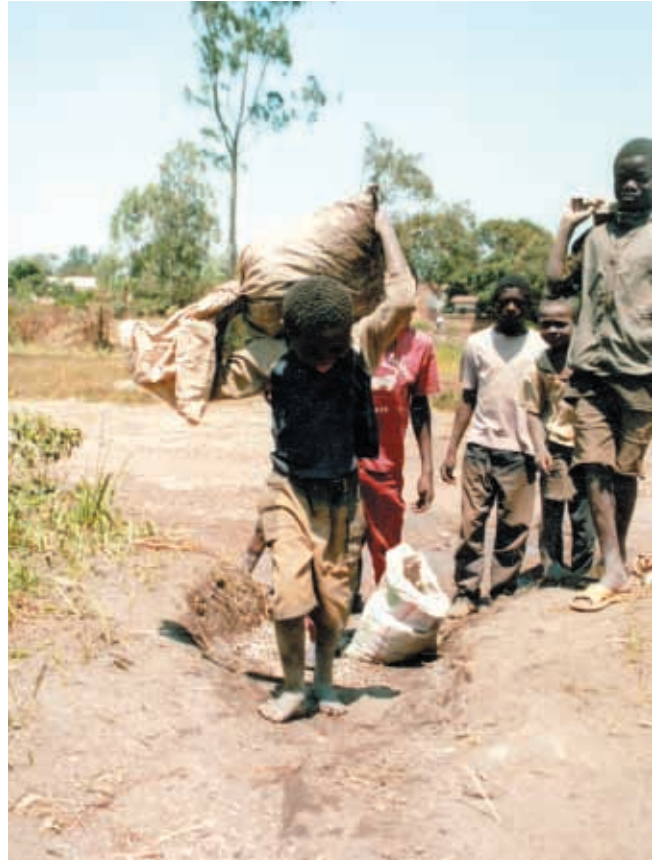
Young boy carrying minerals, Katanga, 2005.