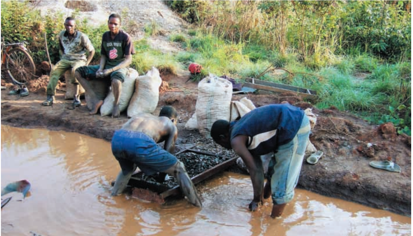
Young men washing minerals, Ruashi mine, Katanga, November 2005.

even though many of them are profiting directly from their work. Government officials, company representatives and EMAK officials interviewed by Global Witness all tried to shift the burden of responsibility onto each other.