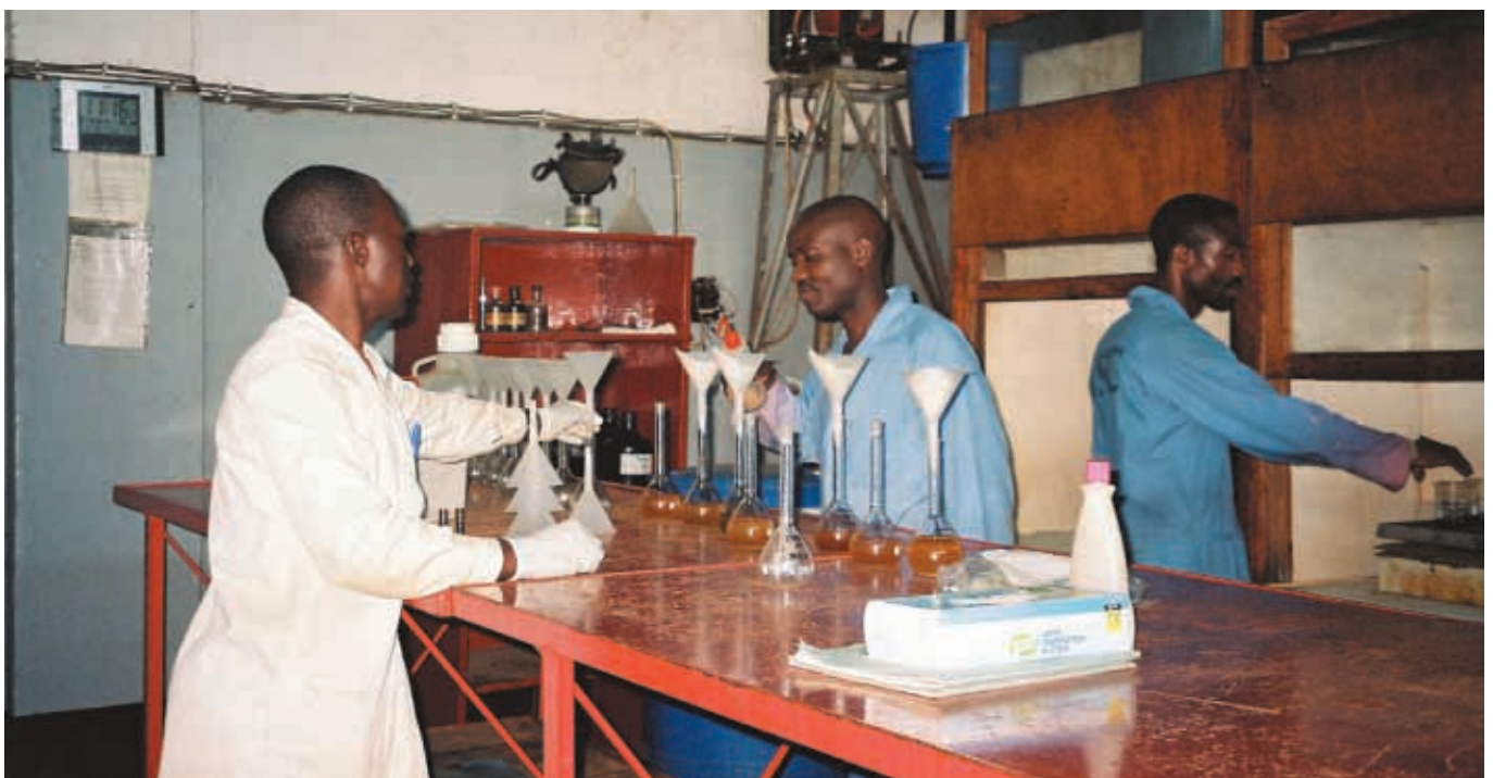
Analysing minerals, ASIC laboratory, Lubumbashi, November 2005.

A local source showed Global Witness an example of a “provisional” certificate provided by an analysis company. He explained that the laboratories usually gave provisional certificates because they were under pressure from the exporters to produce the documents quickly. They were supposed to produce the definitive certificate later, but rarely