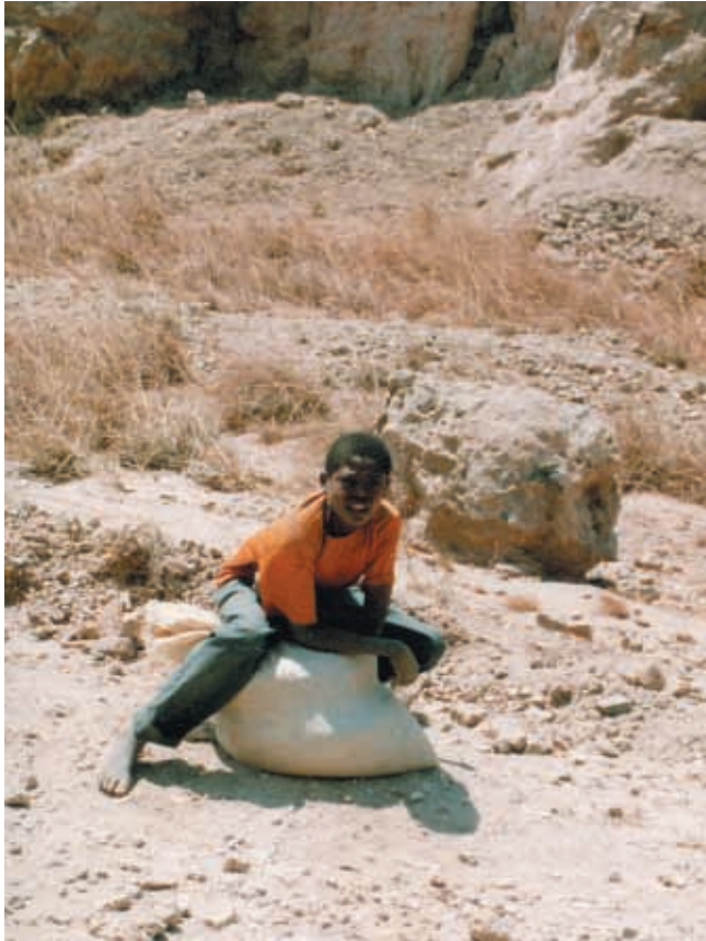
Young boy taking a break from carrying minerals, Mutoshi mine, Katanga, 2005.