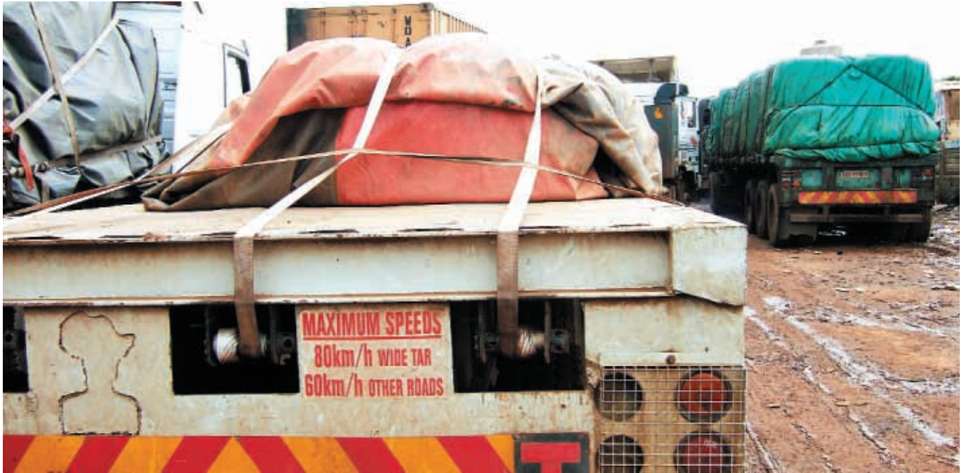
Trucks carrying copper and cobalt, queuing to leave the DRC, Kasumbalesa border, November 2005.