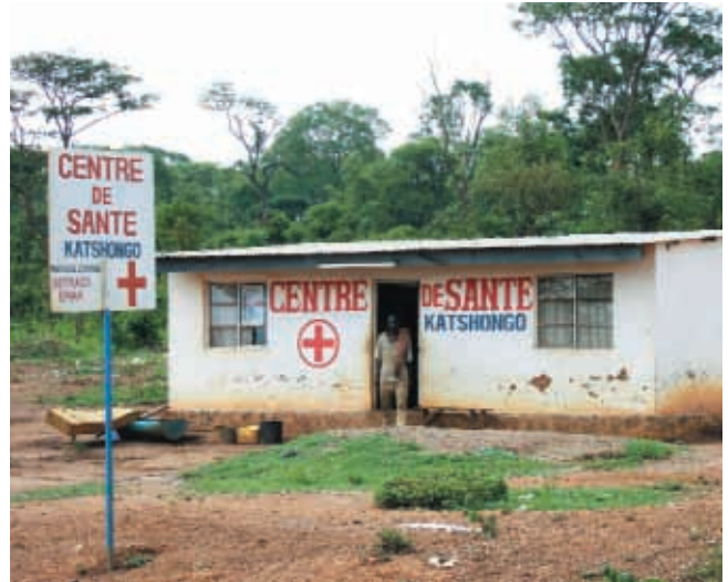
Health centre, near Kawama mine, Katanga, November 2005.

When Global Witness researchers raised the many problems faced by artisanal miners with Congolese government authorities, the standard response was that SAESSCAM would soon be working to resolve these problems. SAESSCAM ( Service d'assistance et d'encadrement du small scale mining ) was set up by the government in 1999 to help organise and exercise oversight over artisanal and small-scale mining. Initially working across several ministries, in 2003 it