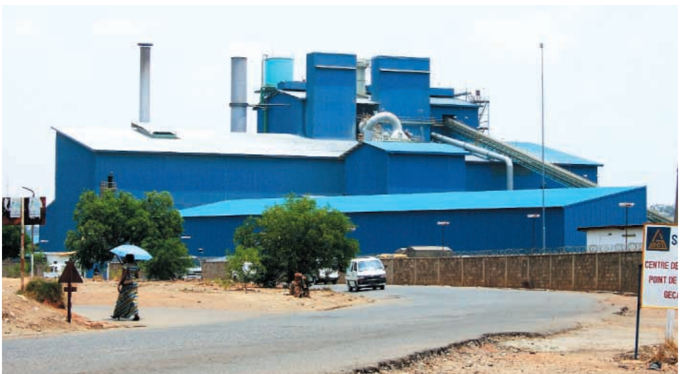
Copper and cobalt processing plant, Lubumbashi, November 2005.

In November 2005, an agreement was finalised for the control of Tenke Fungurume, the world's richest copper mine, giving the US company Phelps Dodge 57.75% ownership,