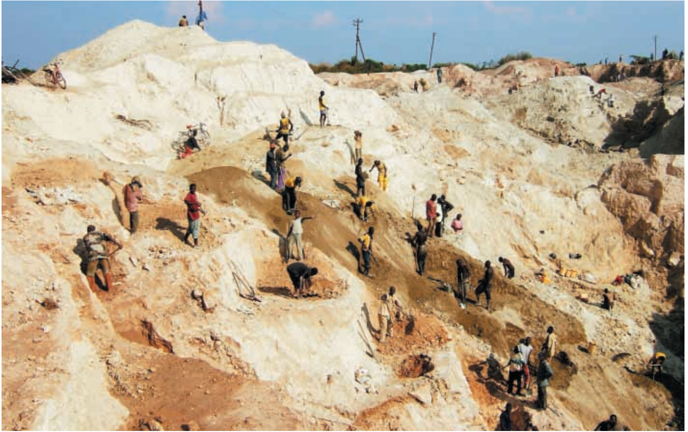
Artisanal miners digging in Ruashi mine, Katanga, November 2005.