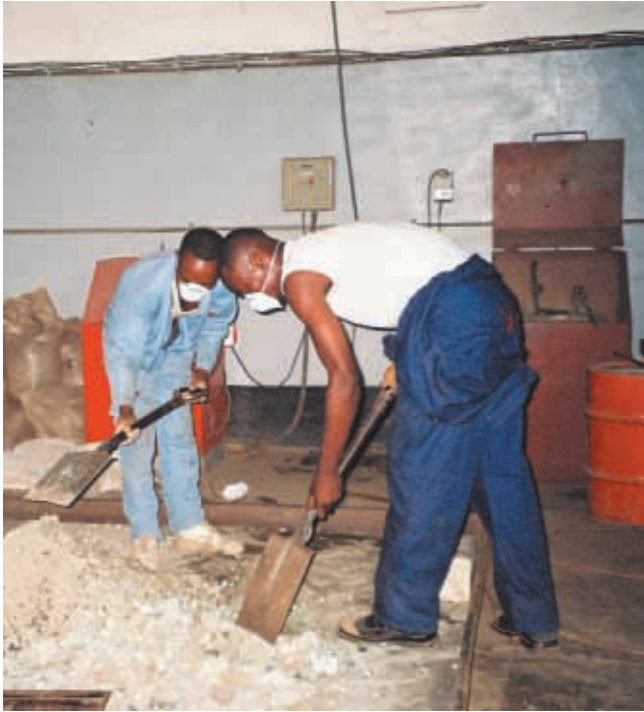
Preparing the minerals for analysis, ASIC, Lubumbashi, November 2005.

did as it was no longer needed once the products had been exported. 75