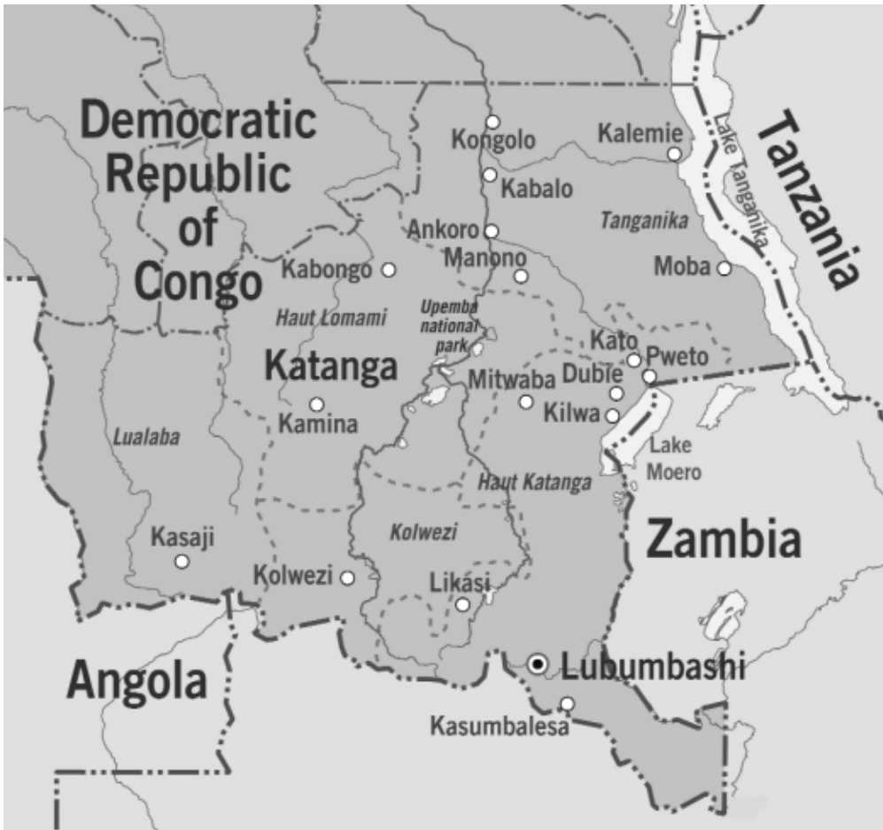
Map of Katanga province. Courtesy of the International Crisis Group, www.crisisgroup.org

The province of Katanga, in the south-east of the Democratic Republic of Congo (DRC), is one of the world's richest copper and cobalt producing areas. Yet the people of Katanga, as in the rest of the DRC, remain extremely poor, and the state has failed to provide most of the province with basic infrastructure and public services, especially in rural areas.