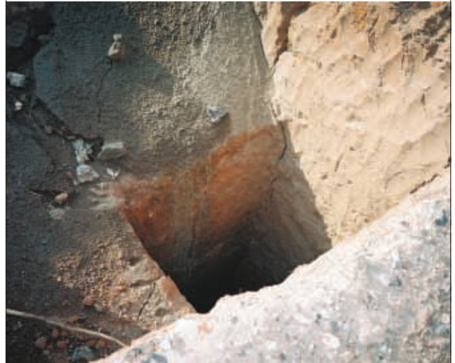
Mineshaft, Ruashi mine, Katanga, November 2005.

There are several reasons for the high rate of accidents in the artisanal mines, including: