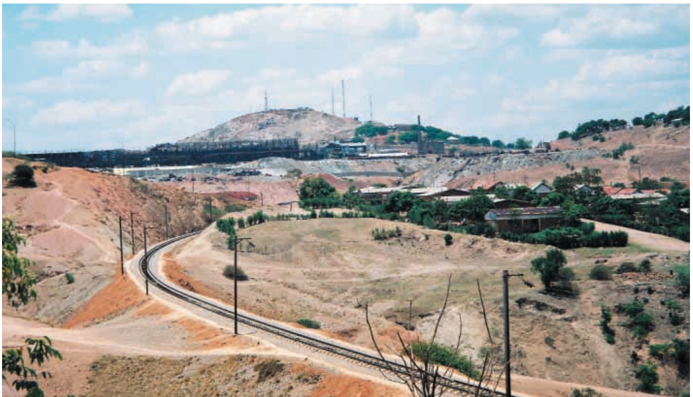
Railway line used to transport copper and cobalt between Likasi and Lubumbashi, Katanga, November 2005.

SOFRECO's work has got off to a difficult start. It has been alleged that the Congolese government deliberately stalled the process, with the result that SOFRECO only commenced work in January 2006, whereas the World Bank's restructuring programme was due to be completed by December 2004. During this time, the transitional government has systematically "sold off" to private companies most of the mines or plants that would have enabled Gécamines to become commercially viable. Many of these deals were rushed through in 2005 before SOFRECO could commence work. "What will SOFRECO do when they come? There is nothing left to exploit," a Congolese mining expert told Global Witness. 145