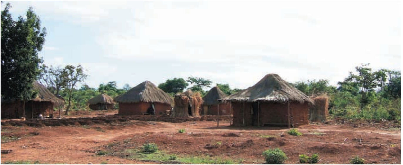
Village between Lubumbashi and Likasi, Katanga, November 2005.