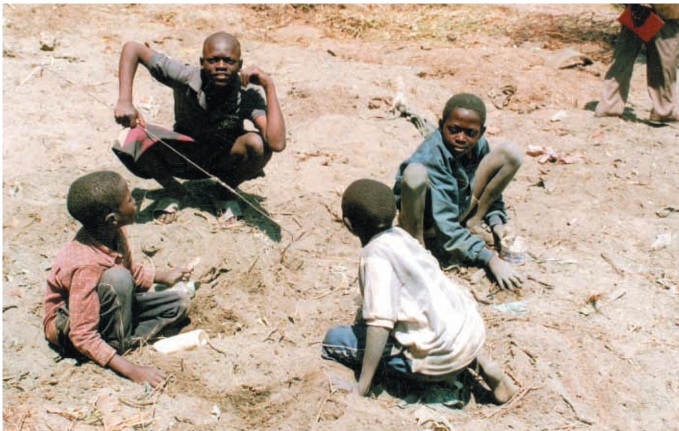
Children working in a mine, Kolwezi, Katanga, November 2005.