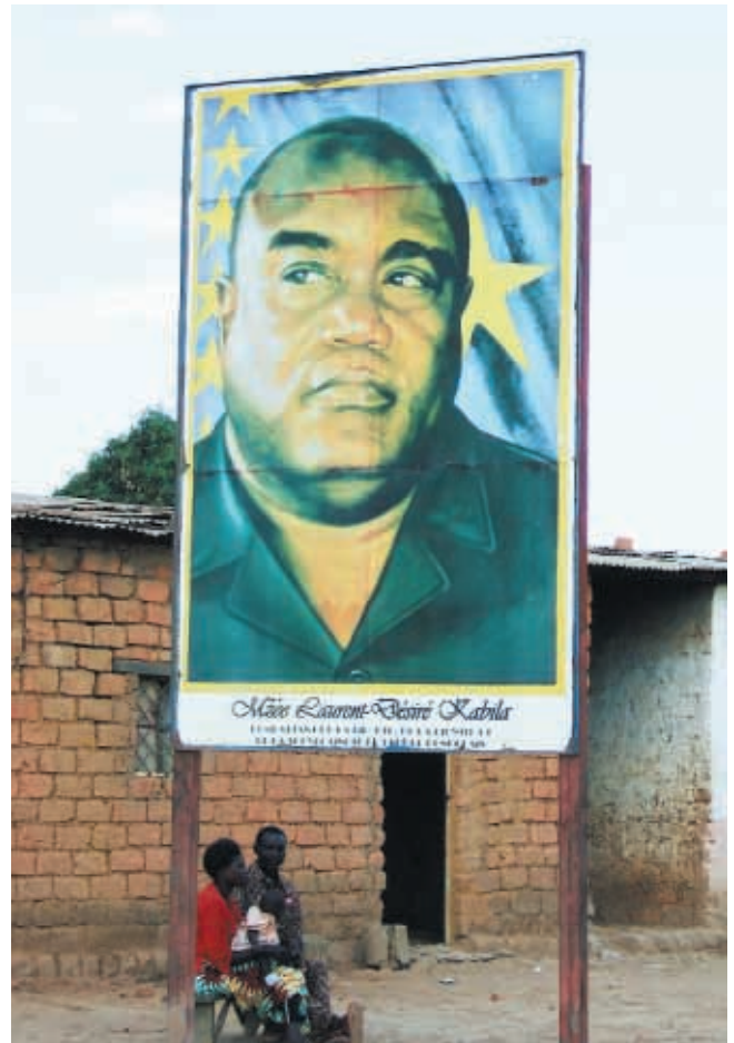
Portrait of Laurent Kabila, village between Lubumbashi and Likasi, Katanga, November 2005.

was impossible for a company – whether big or small – to operate in Katanga without a “political umbrella”, meaning protection and support from politicians in Kinshasa. 183 The involvement of members of the political elite in the mining sector in Katanga occurs both in the formal industrial sector, where they are alleged to have close links to some of the big mining companies, and in the artisanal sector, where they are facilitating illicit exports by trading companies and individuals on a regular basis.