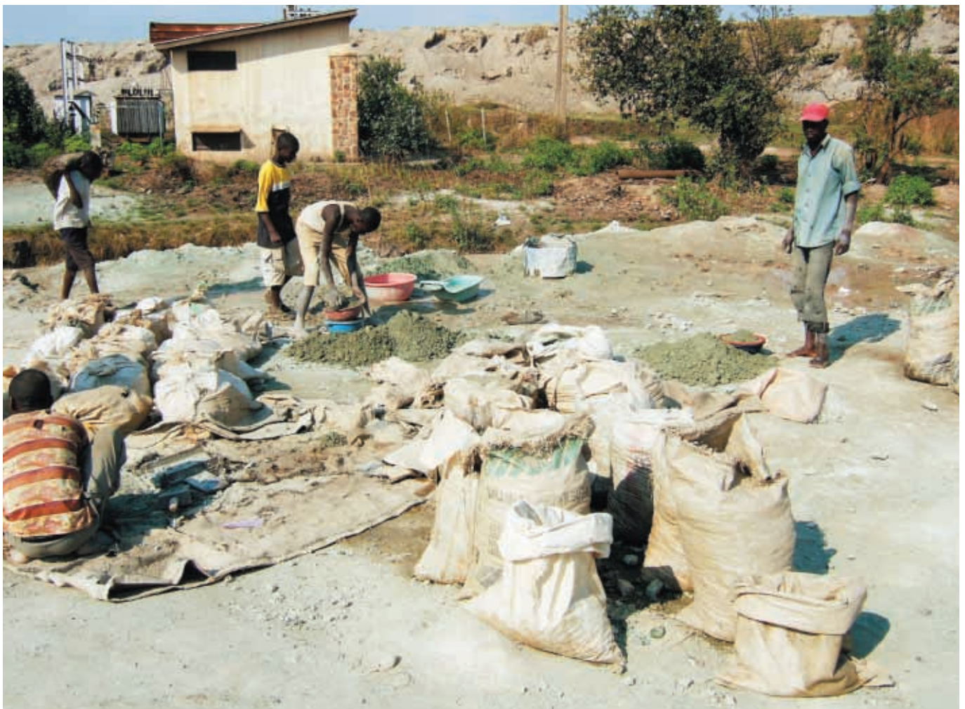
Sorting the minerals into bags, Ruashi mine, Katanga, November 2005.

EMAK has its own internal “police” or security force, known as the Policar ( Police des carrières ). The Policar is not a law enforcement agency and is completely separate from the Police des mines, the official branch of the national police force responsible for law and order in the mines. The main functions of the Policar are to protect the products from the mines against theft or substitution and to resolve disputes between miners or between miners and négociants. According to the president of EMAK in Kolwezi, the Policar do not receive salaries, only “a small premium to encourage them, a per diem.” 89 A miner said that in Kisankara mine, miners used to have to give the Policar one bag of minerals per mineshaft. If they refused, the Policar would go down the mineshaft themselves, as many of them were miners, and take minerals by force from the mineshafts where other miners were digging. 90 In other mines,