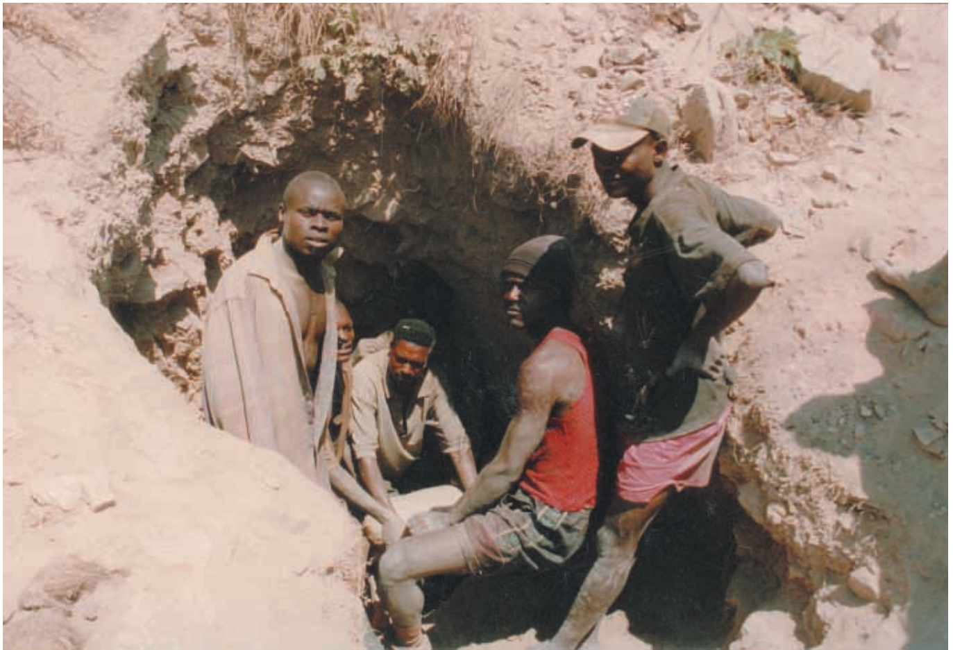
Miners coming out of a mineshaft, Katanga, 2005.

ments usually asked for between US $3,000 and $5,000 per truck, regardless of the weight or value of the products. v This was in addition to the official 1% exit tax on the declared value of the goods. The fees sometimes varied, depending on the individual demanding the bribe: “If the official knows the product well, it will be higher.” 37