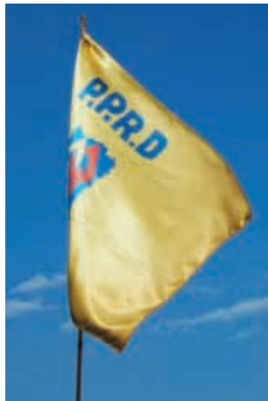
PPRD flag, village between Lubumbashi and Likasi, Katanga, November 2005.

Testimonies gathered by Global Witness indicate that politicians at the provincial and local levels in Katanga also take a cut from mining deals. However, according to local sources, most of them tend to profit through opportunism rather than through direct political influence. Provincial authorities do not usually hold the power to make or break these