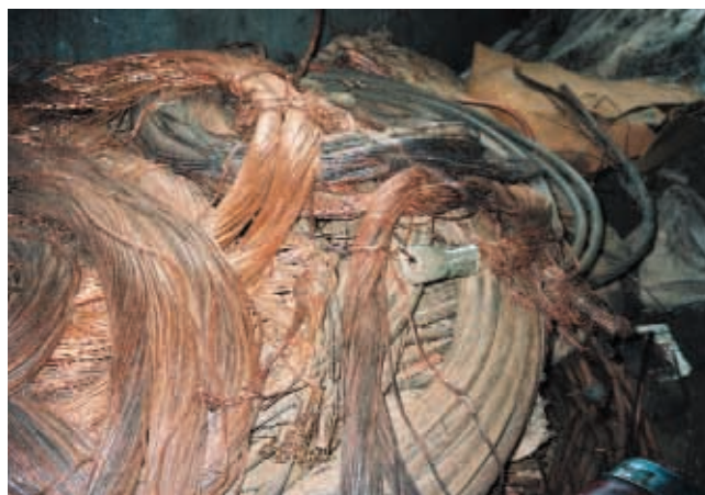
Stolen copper cables impounded by authorities, Kolwezi, Katanga, November 2005.