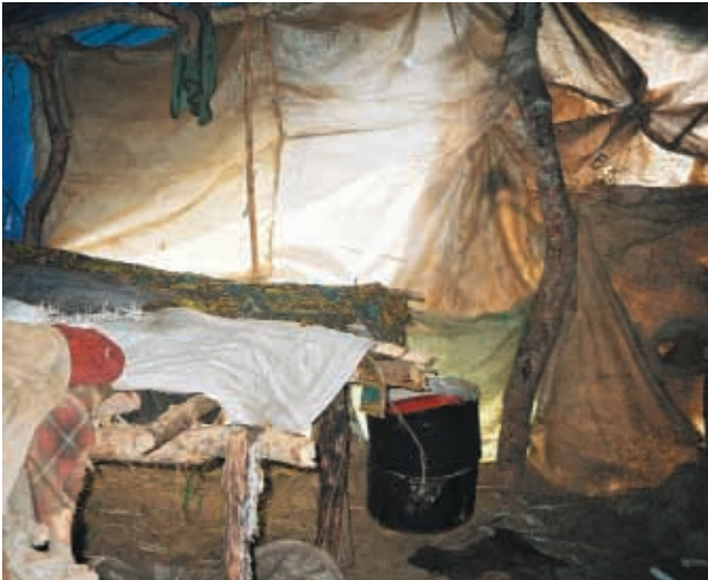
Inside a miner's tent, near Kawama mine, Katanga, November 2005.

of them had been paid since the beginning. As they had been hired by CMKK and had an agreement with them, they were not able to sell their products to other buyers. Even miners who had chosen not to become members of CMKK were obliged to sell to CMKK if they worked in Kawama. 95 Global Witness was informed that the miners finally received their first payment from CMKK in early December 2005. 96