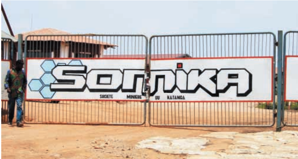
SOMIKA headquarters, Lubumbashi, November 2005.

private individuals, some of whom are well-known in the mining sector as intermediaries or unofficial agents for companies, operate at the border and intervene whenever a problem arises. 50